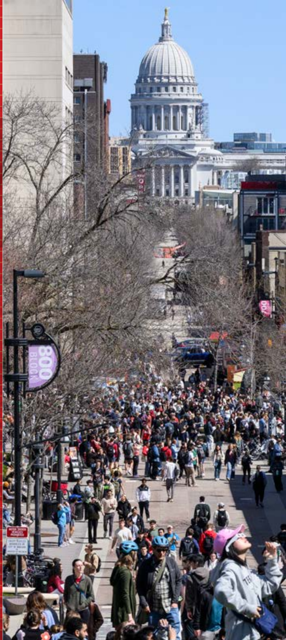
People gather on Bascom Hill and State Street Mall to watch the 86-percent solar eclipse at the University of Wisconsin–Madison on April 8, 2024.

The transition to college is a big step for students, as well as their parents and families.