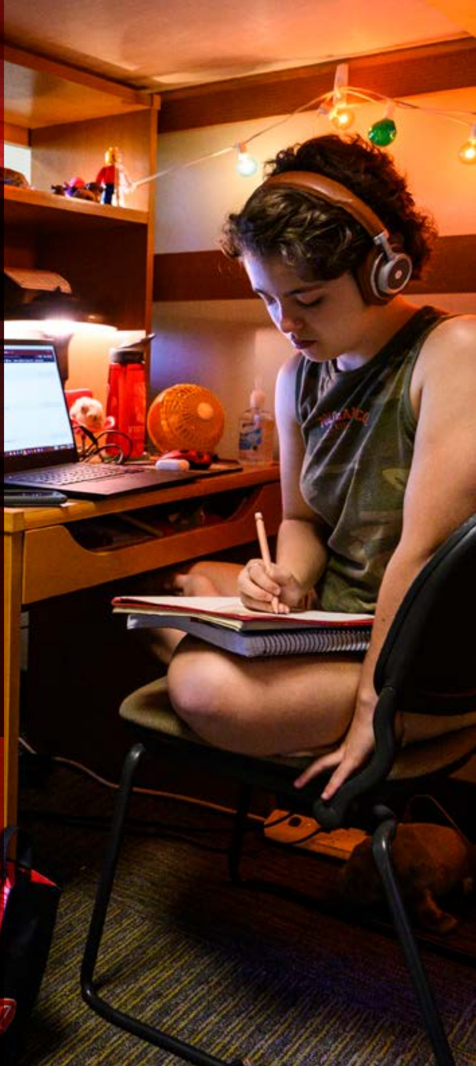
A first-year undergraduate student takes notes while studying in her room at Elizabeth Waters Residence Hall.

When your student enters college, your relationship will change. Now is a great time to begin or continue conversations about your student's health and wellbeing in college. We understand these are difficult topics, and everyone has unique personal values that reflect what is important to them.