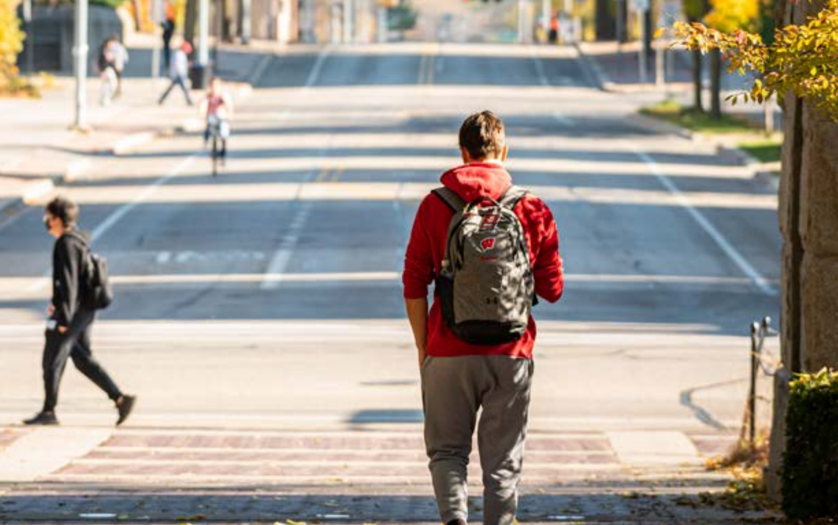
Students walk among the colors of the fall leaves near Camp Randall Arch autumn 2021.