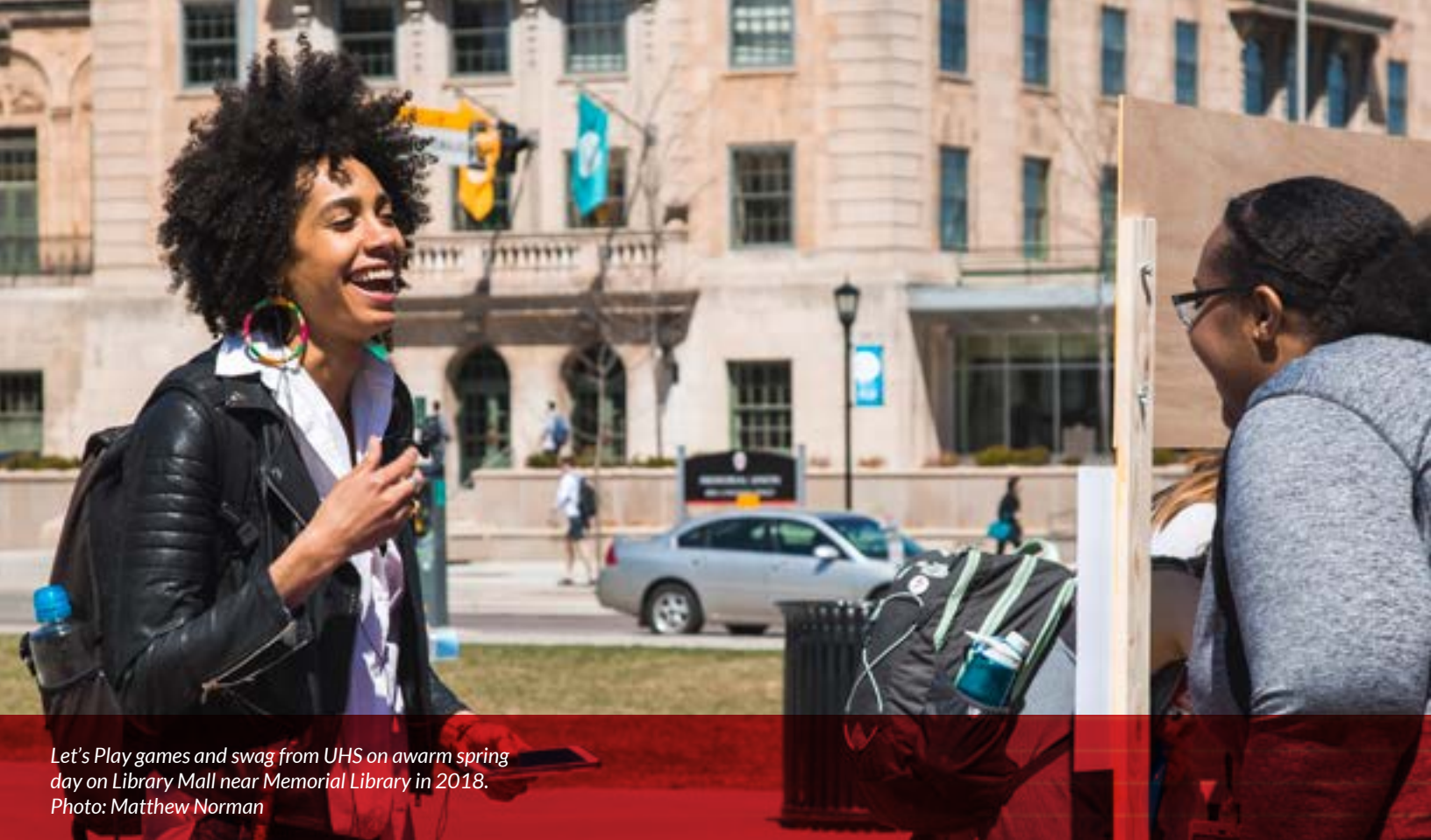
Let's Play games and swag from UHS on a warm spring day on Library Mall near Memorial Library in 2018.