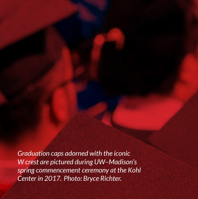
Graduation caps adorned with the iconic W crest are pictured during UW–Madison's spring commencement ceremony at the Kohl Center in 2017.