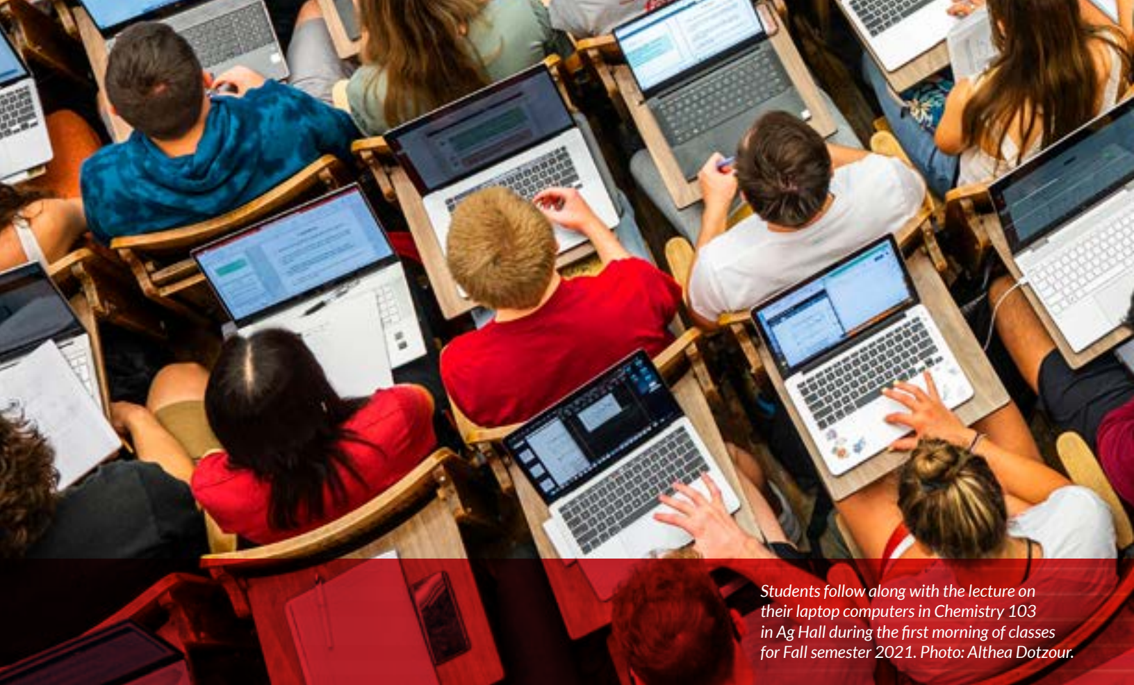
Students follow along with the lecture on their laptop computers in Chemistry 103 in Ag Hall during the first morning of classes for Fall semester 2021.