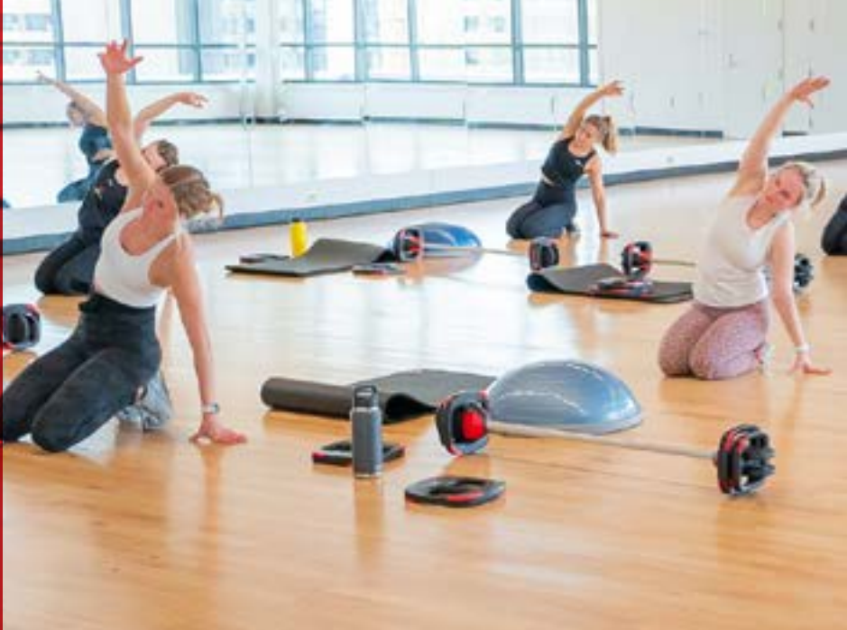
Students participate in a group strength class held at the Nick (Nicholas Recreation Center) in Spring of 2022.

If a student knows that they would like to file a formal report, they can report to the Office of Student Assistance and Support, the Sexual Misconduct Resource and Response Program, and/or a law enforcement agency. Sexual assault, intimate partner violence, sexual harassment, and/or stalking are forms of gender discrimination and violations of Title IX federal law, state law, and the UW System Administrative Code.