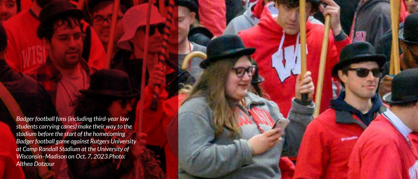
Badger football fans (including third-year law students carrying canes) make their way to the stadium before the start of the homecoming Badger football game against Rutgers University at Camp Randall Stadium at the University of Wisconsin–Madison on Oct. 7, 2023.