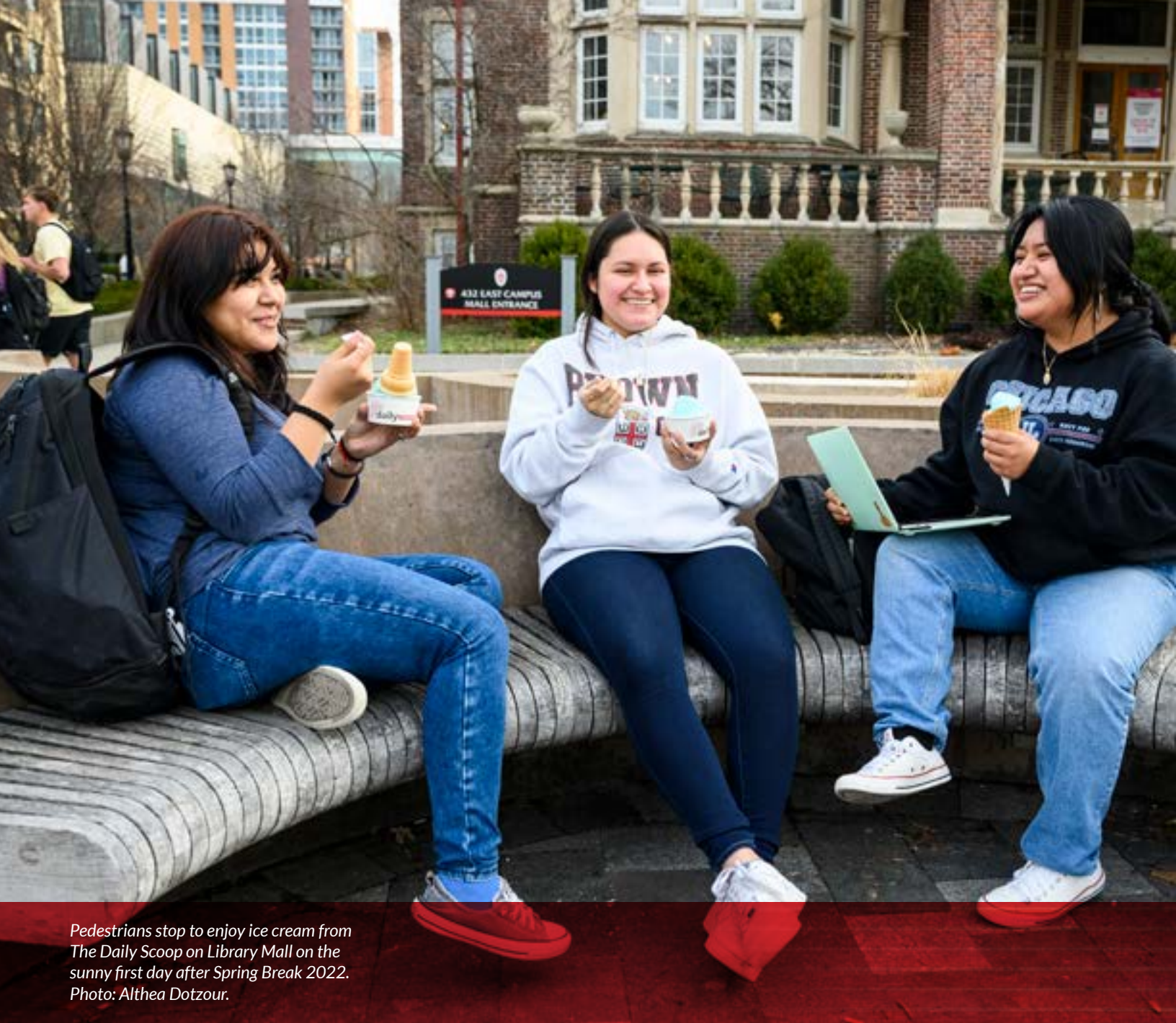
Pedestrians stop to enjoy ice cream from The Daily Scoop on Library Mall on the sunny first day after Spring Break 2022.

■ All students deserve to feel safe and welcome on campus. By understanding key health concerns students face, parents and families can start conversations to support their student's wellbeing.